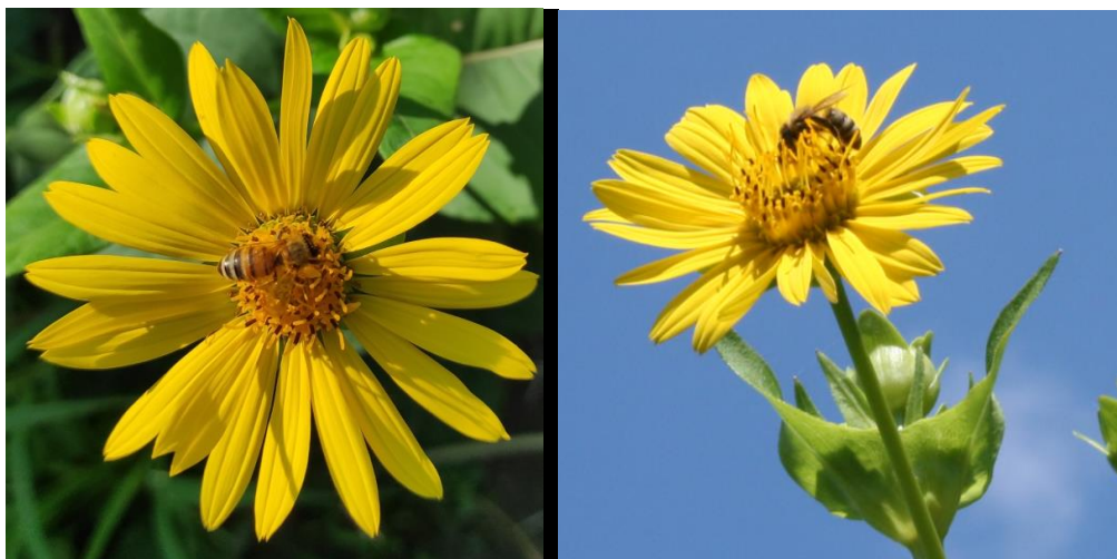
Figure 2. Pollinating insect (honeybee).

cultivar of the cup plant, at the end of the flowering stage, reached 320-373 cm in height, and the yield of aerial phytomass was 12-15 kg/m 2 . The dry matter from the harvested phytomass contained 66 g/kg crude protein, 46 g/kg ash, 604 g/kg NDF, 411 g/kg ADF, 83 g/kg ADL, 328 g/kg cellulose, 193 g/kg hemicellulose, 569 g/kg digestible dry matter, relative feed value (RFV) = 92, 11.32 MJ/kg digestible energy, 9.2 MJ/kg metabolisable energy and 5.31 MJ/kg net energy for lactation.