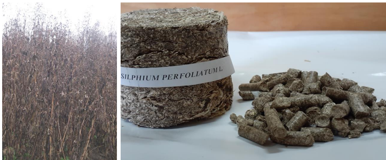
Figure 3. Energy biomass, briquettes and pellets.

Silphium perfoliatum is considered a potential energy crop, since the harvested fresh aerial phytomass can serve as substrate for anaerobic digestion at biogas plants. It was estimated that the phytomass substrate from the 'Vital' cultivar of the cup plant, harvested at the end of the flowering stage, had a biomethane production capacity of 230 l/kg and the potential productivity of a plantation was 6500-7000 m 3 biomethane per hectare. Siwek et al., 2019, mentioned a biomethane production potential of the S. perfoliatum substrate of 8598 m 3 /ha, as compared with 4759 m 3 /ha for Sida hermaphrodita L. Rusby [13].